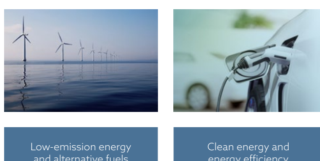
Figure 3. The fund's environment-related mandates and their relationship with the SDGs

Through our environment-related mandates, we invest in companies and technologies that foster more environmentally friendly economic activity. A part of our work involves defining the environmental investment universe. We use specialised external data providers and our own sustainability data to analyse companies' activities in order to identify providers of goods and services in environment-related industries. The companies we invest in can be broadly classified by the main type of technology they develop: i. lowemission energy and alternative fuels, ii. clean energy generation and energy efficiency, and iii. natural resource management. These environment-related investments support the transition to a more sustainable global economy and thus make a contribution to a number of SDGs, such as SDG 6: Clean Water and Sanitation, SDG 7: Affordable and Clean Energy, SDG 9: Industry, Innovation and Infrastructure, SDG 11: Sustainable Cities and Communities, SDG 12: Responsible Consumption and Production and SDG 13: Climate Action.