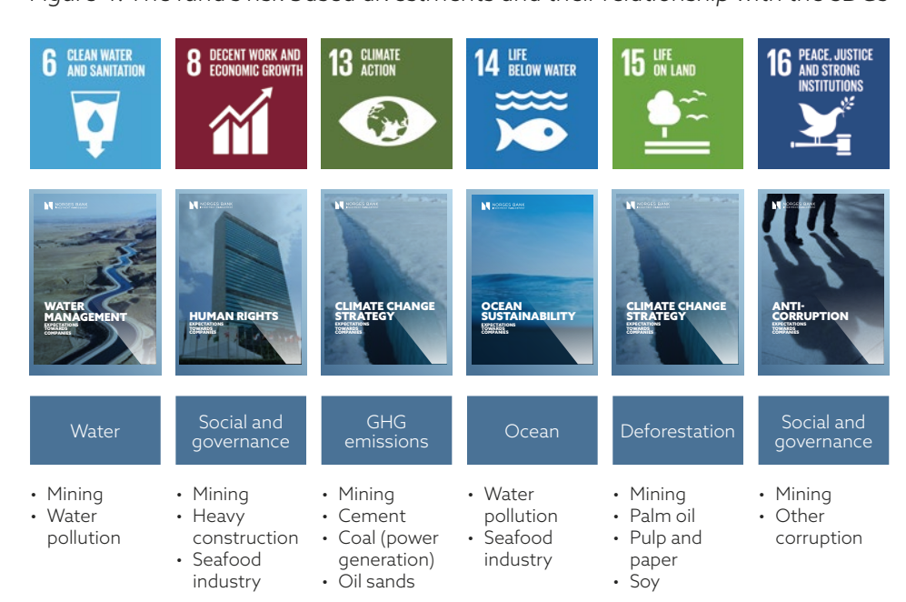
Figure 4. The fund's risk-based divestments and their relationship with the SDGs

Business practices that we consider unsustainable may also impede progress towards achieving the SDGs. Our main areas of risk-based divestments have related to, among others, deforestation, unsustainable water management, and greenhouse gas emissions. For instance, we divested from palm oil producers as their production methods can cause tropical deforestation and thus undermine the ambition of both SDG 15: Life on Land and SDG 2: Zero Hunger. Following assessments of water use and water pollution in the mining sector, we conducted risk-based divestments from companies involved in mountain top removal mining and gold mining whose activities could be seen as impeding progress towards SDG 6: Clean Water and Sanitation. We carried out risk-based divestments from a number of companies producing oil from oil sands, as this carbon-intensive production method is associated with particularly high greenhouse gas emissions, which conflicts with SDG 13: Climate Action. Further risk-based divestments relate to SDG 3: Good Health and Well-being, SDG 7: Affordable and Clean Energy, SDG 8: Decent Work and Economic Growth, SDG 13: Climate Action, SDG 14: Life below Water, SDG 15: Life on Land and SDG 16: Peace and Justice and Strong Institutions.